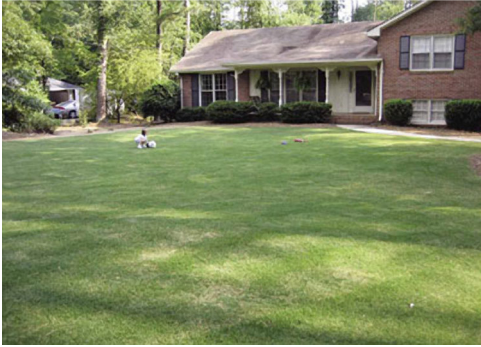
One of the biggest uses of TifGrand™ may prove to be for tree-lined home lawns, such as this home in Georgia.